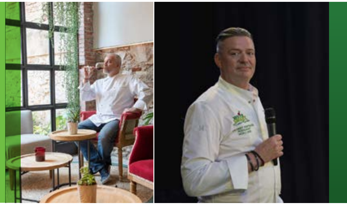
Chef Xavier Pellicer , Restaurant Xavier Pellicer (Spanje)

A "Plant Food Untouchable" chef is an example for all chefs and vegetable lovers around the world. The title is only bestowed on chefs who have made it into the We're Smart® Top 100 list at least twice in their career. They are then inducted into the We're Smart® Elders which plays an advisory role within We're Smart® World. An Untouchable is no longer listed in the Top 100 list but is bestowed an honorary place that is hors categorie.